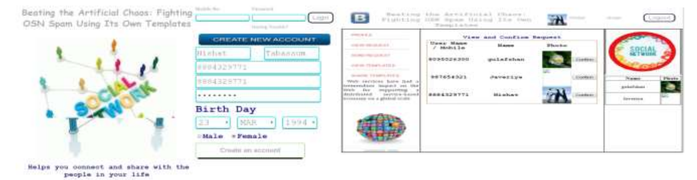
Fig2: Registration Details