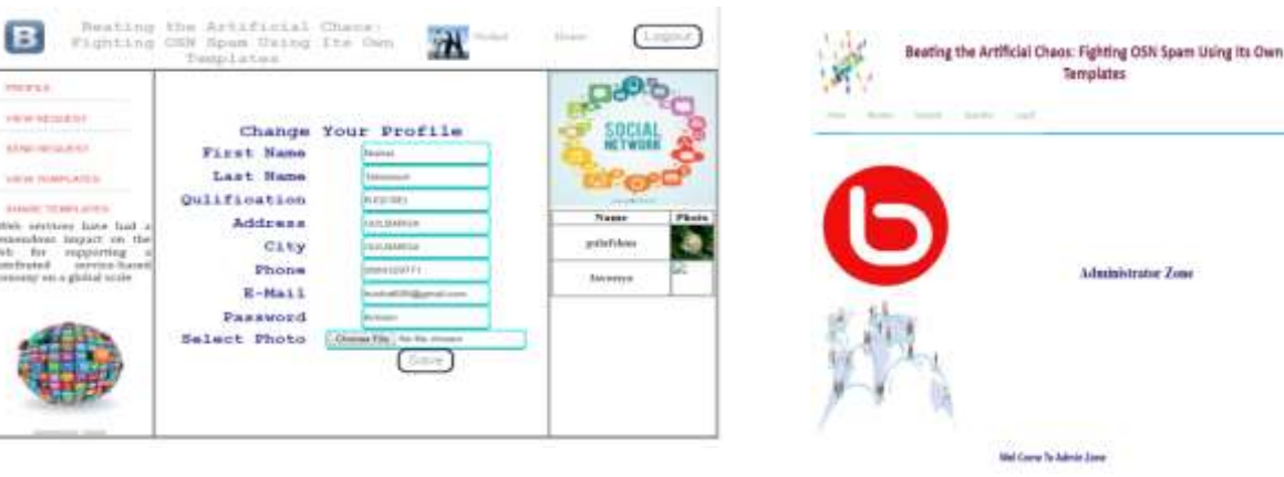
Fig3: Edit Profile